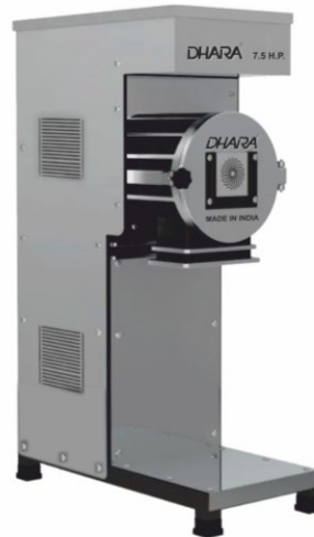
7.5 H.P. (2 IN 1)