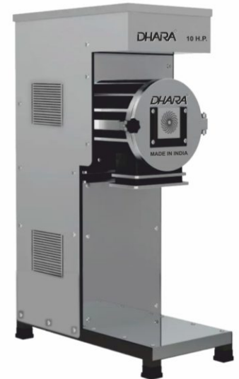
10 H.P. (2 IN 1)