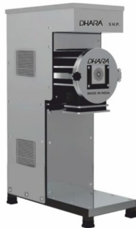
5 H.P. (2 IN 1)