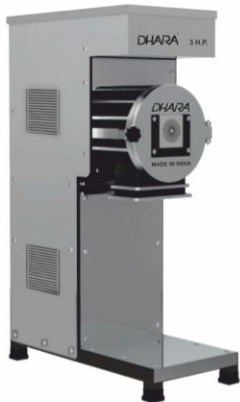
3 H.P. (2 IN 1)