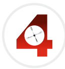
4 Blade S.S. Beater