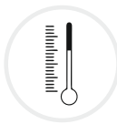
Air Cooled High-tech filter, which controls hot air and keep the flour cool & nutritious.