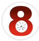
8 Blade S.S. Beater