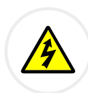
Electric Overload Protection