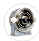
Aluminium Grinding Chamber