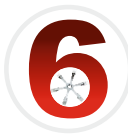
6 6 Blade S.S. Beater