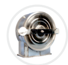
Aluminium Grinding Chamber