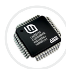
Digital Auto Control System