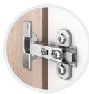
Dabi Hi-tech Hinges